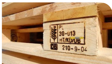
Pic 1. Phytosanitary treatment marking.

Phytosanitary treatment mark – solid wood packaging (pallets in particular) imported within the European Union, including Poland, must be marked in accordance with the requirements of The International Standards for Phytosanitary Measures No. 15 (ISPM 15). Fulfilment of the requirement is confirmed by a special ISPM-certified mark and the unique certification number of a treatment provider being placed on the middle or side stringer or supporting block .